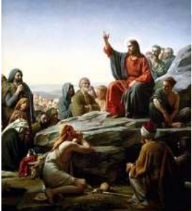
ILLUSTRATION IN RABBIS