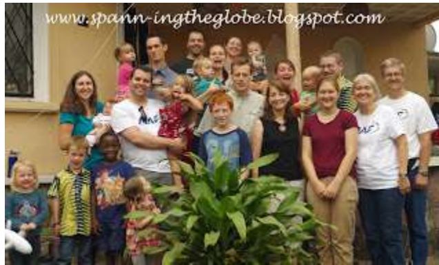
The whole crew, silly faces and all! (12 kids & 12 adults)