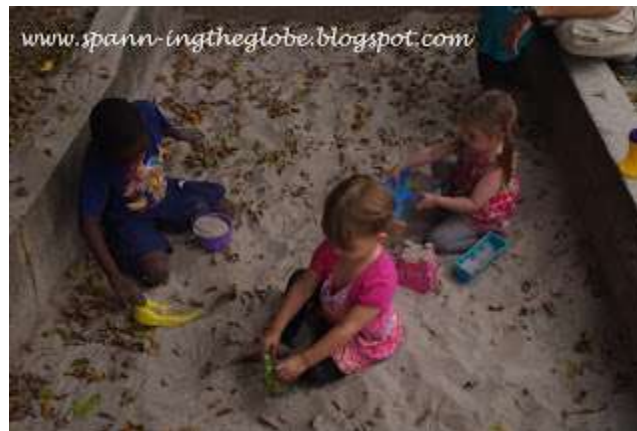
Some of the kids playing in the "sand" box