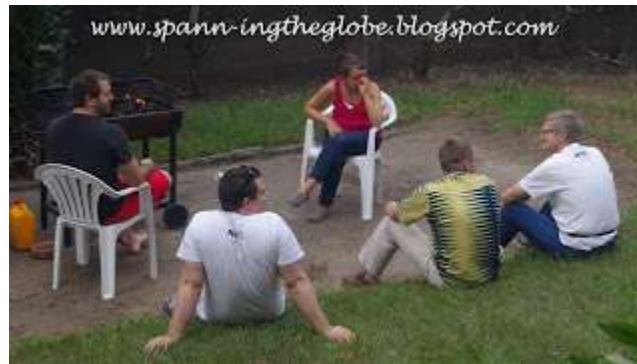
Waiting on the local charcoal to heat up